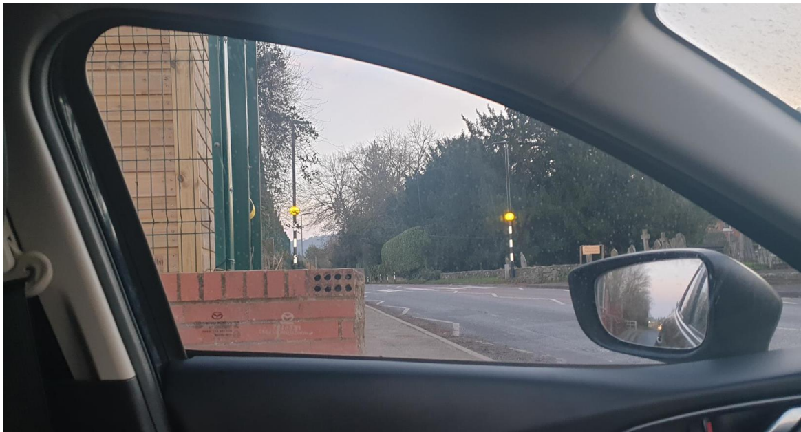
Figure 2: view to the south along the A4111